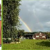
Club rooms with all facilities