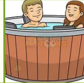
Wood fired hot tub