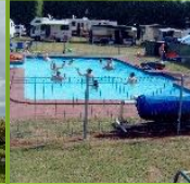
solar heated pool